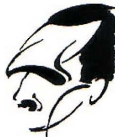
Sketch by Takis Kalmouthos, 1929

My anxiety is found in this: to incessantly strive for this position and from antithesis to find Synthesis. .